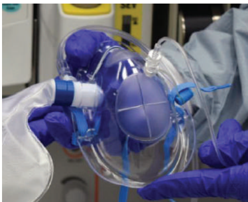
Figure. Procedural Oxygen Mask.

The high FiO 2 levels provided by the Procedural Oxygen Mask allow effective preoxygenation to be