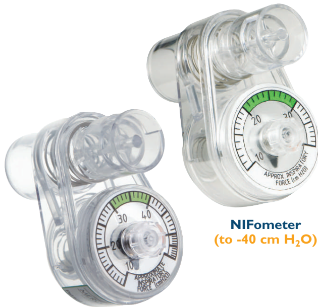
NIFometer (to -40 cm H 2 O)

The quick & convenient way to measure NIF.