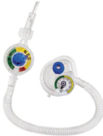
Figure 3: Infant T-piece resuscitator