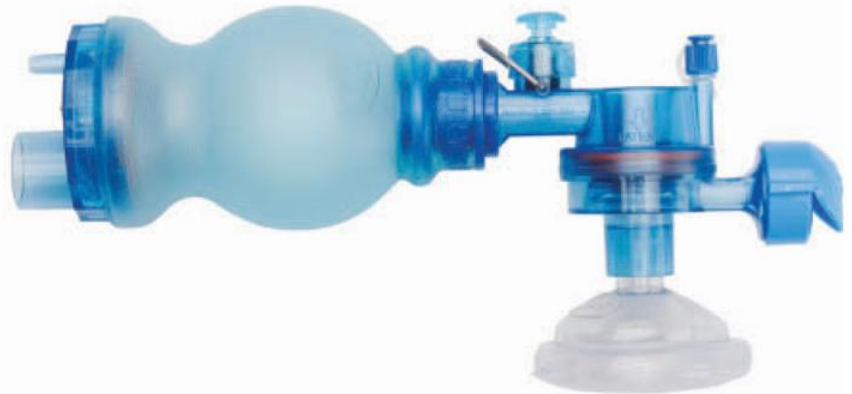
Figure 1: Bag-valve mask

Tidal Volume (V t ): The amount of air inhaled or exhaled in a single resting breath.