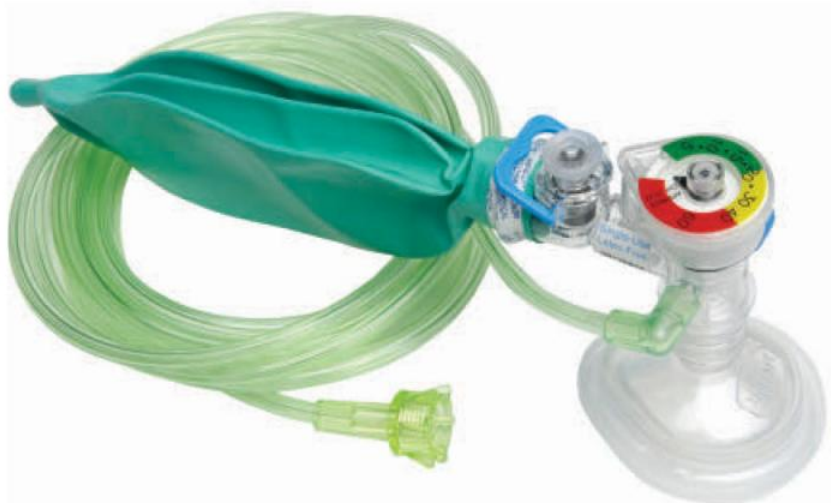
Figure 2: Flow-inflating bag with manometer

Using a BVM without a pressure manometer on newborns is risky. Many clinicians attest to being able to “feel” lung compliance with a BVM. However, I'm somewhat skeptical if this is true in inexperienced hands. In addition, continuous positive airway pressure (CPAP) , a technique used after delivery and in the neonatal ICU, is not an option with a BVM. However, the BVM will still function without oxygen or compressed air