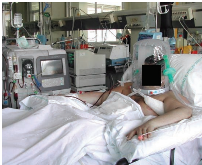
Figure 2: The Helmet to Provide Non-invasive Continuous Positive Airway Pressure in the Post-operative Period

and one-lung ventilation, with no PEEP). By contrast, in other randomised studies 46,47 including a heterogeneous group of major thoracic and abdominal surgical procedures, protective mechanical ventilation was not associated with a decrease in intra-pulmonary and systemic inflammation. Furthermore, there was no evidence that protective ventilation prevented lung adverse effects or decreased systemic cytokine levels in cardiac surgery. 48 However, adoption of a low tidal volume in patients without pre-existing lung injury may favour the development of atelectasis; hence, use of low tidal volume in the absence of recruitment or PEEP in anaesthetised patients without lung injury is not generally recommended. 49